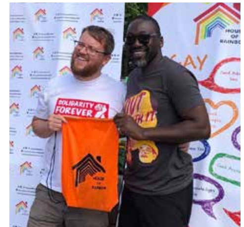
House of Rainbow CIC