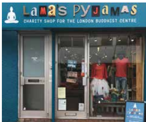
Lama's Pyjamas Charity Shop for the London Buddhist Centre