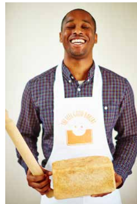
Regenerate UK and it's Feel Good Bakery