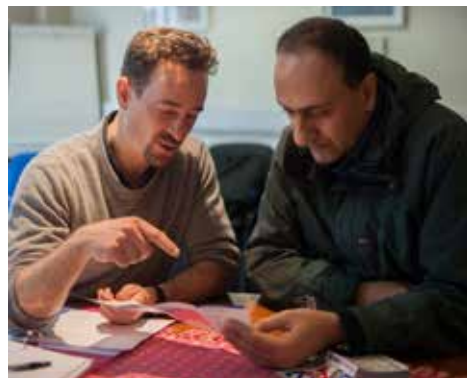
Jesuit Refugee Service UK