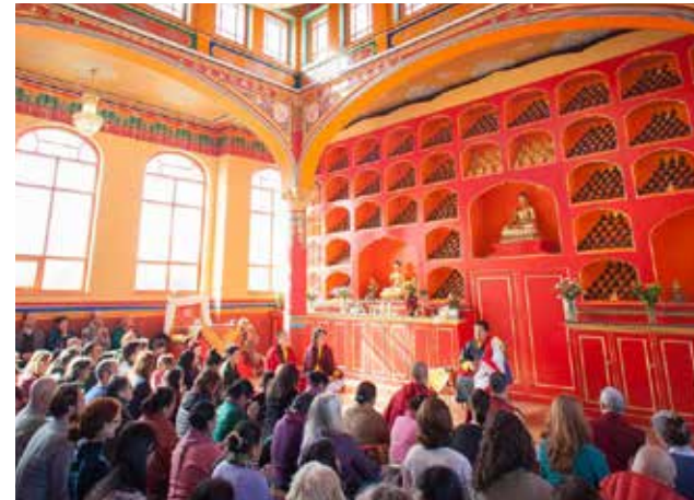
Kagyu Samye Dzong London

Crime and violent attacks send a message of exclusion and tear the fabric of London's communities. Projects within this category: support those affected by violence; bring communities together to stand against violence; and promote peaceful relations.