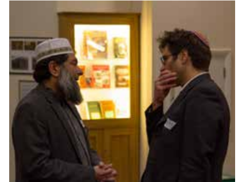
St John's Waterloo - Faith for the Climate Network