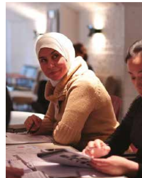
St Margaret's Church, Lee – The ESOL and Friendship Project