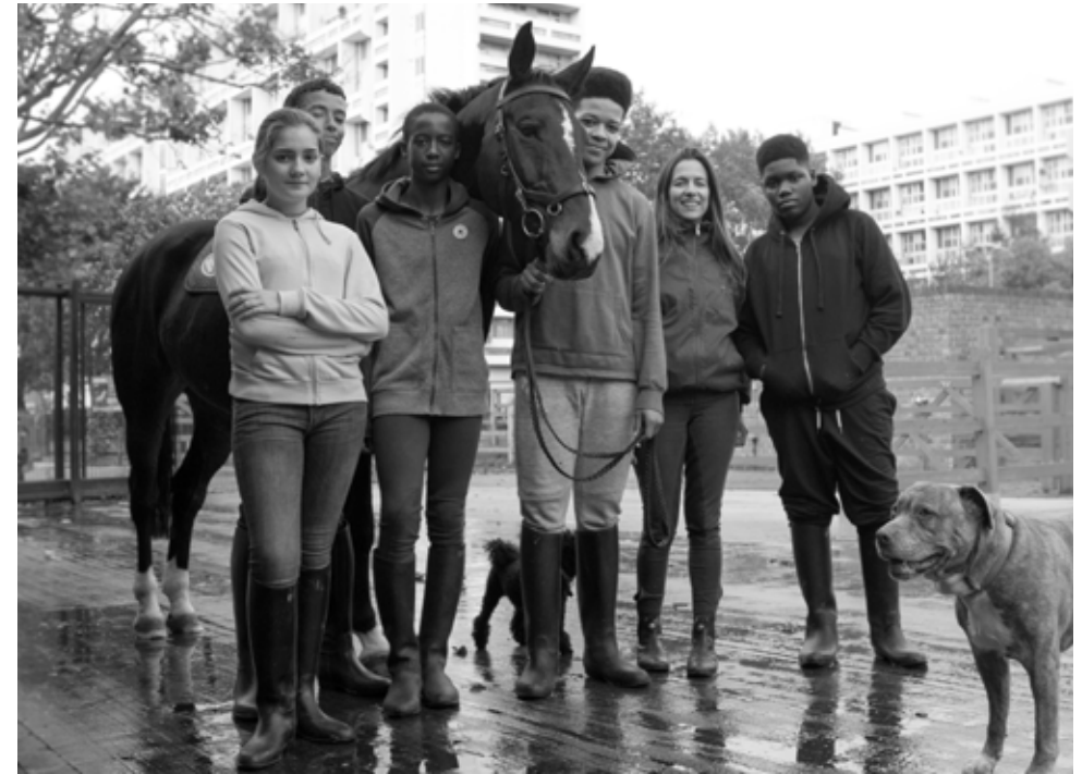
Ebony Horse Club

Young people from minority backgrounds are often overlooked and may be excluded from civic life. Projects within this category work with young people to encourage leadership and participation in their local community, and connect them with opportunities beyond their neighbourhoods.