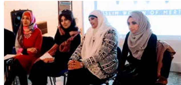
Muslim Women Merton