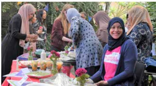
New Roots Tower Hamlets