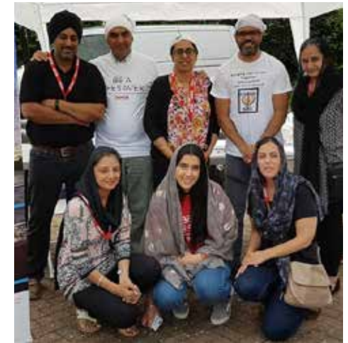
British Sikh Nurses