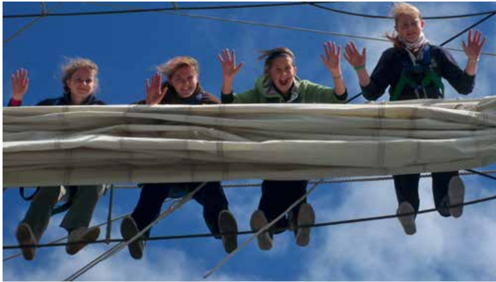
Jubilee Sailing Trust