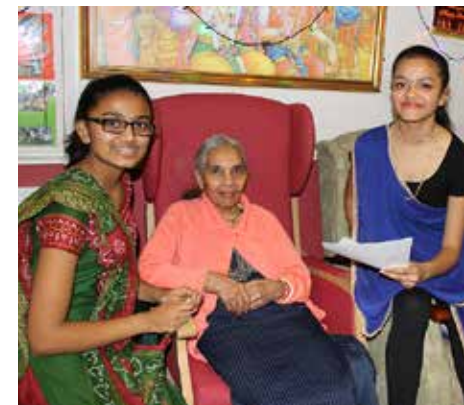
BAPS Swaminarayan Sanstha