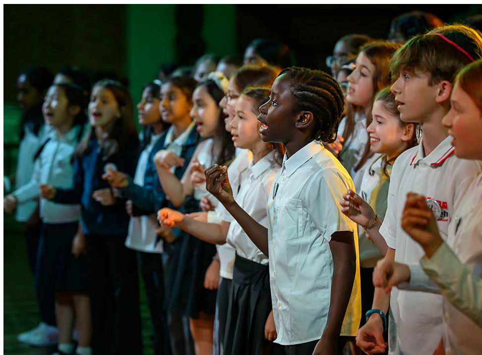
Barnet SACRE Interfaith Choir