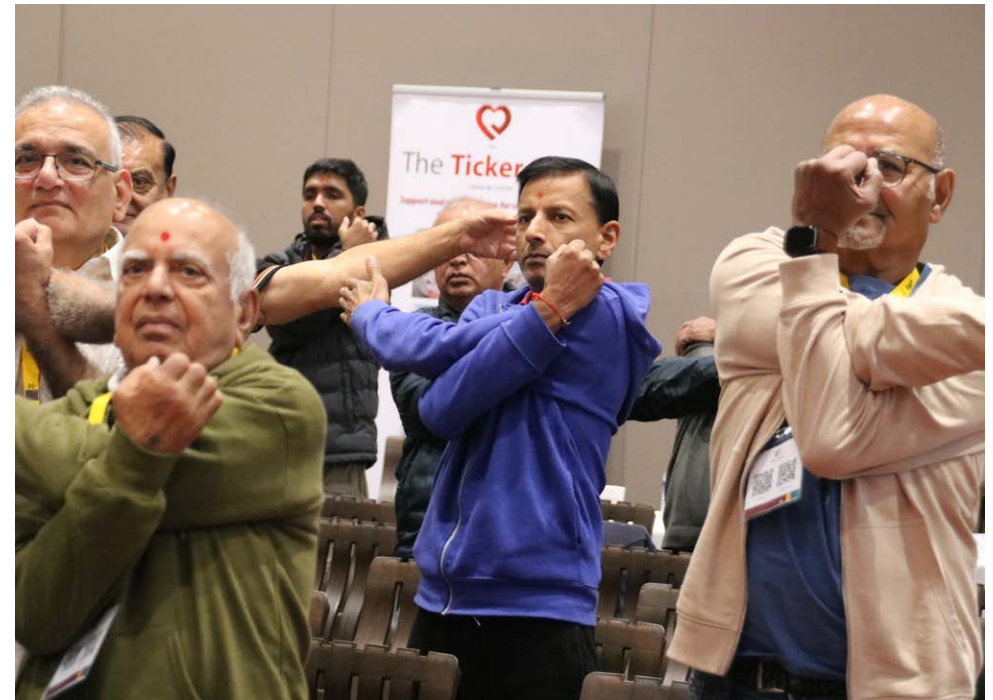
BAPS wellNESS Project

Projects in this category provide specialised services to enhance the health and wellbeing of Londoners. These initiatives play a vital role in reducing social isolation and improving the quality of life for vulnerable individuals across diverse backgrounds. Through compassionate care and support, they help build stronger, more inclusive communities where everyone can thrive.