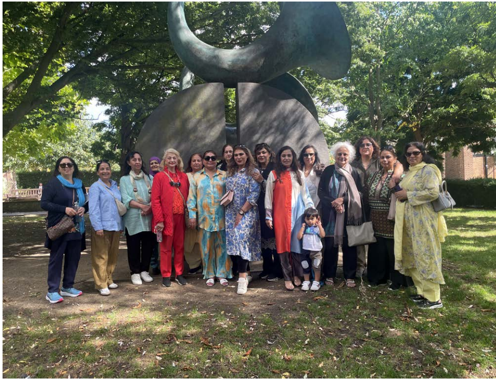
The London Asian Ladies Club (LALC)