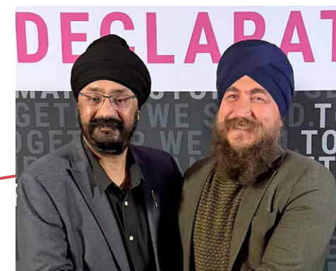
Sikh LGBT+ Inclusion

www.instagram.com/sikh_lgbt_inclusion/?hl=en