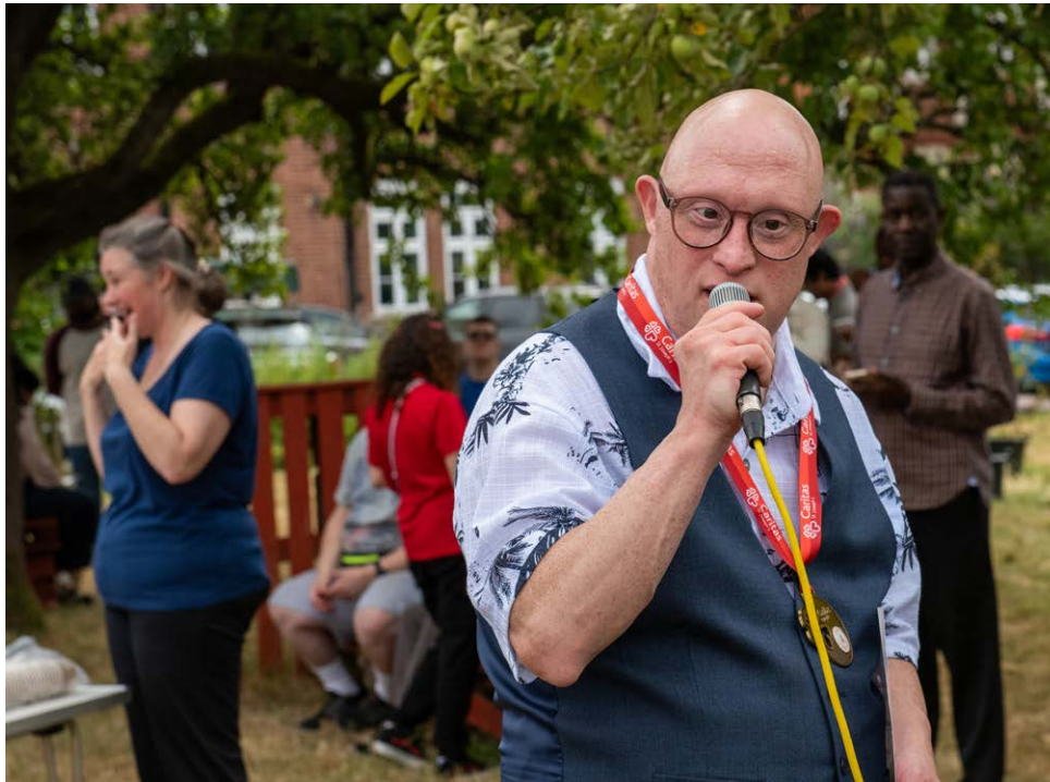
Caritas St Joseph's