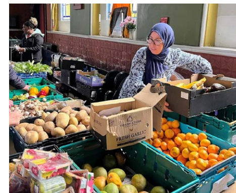
Community Food Distribution