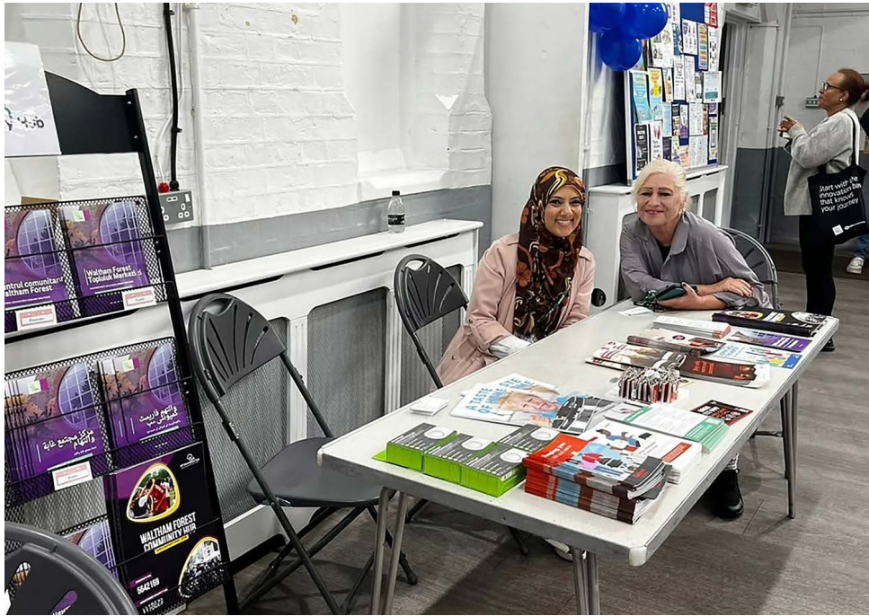
Waltham Forest Community Hub