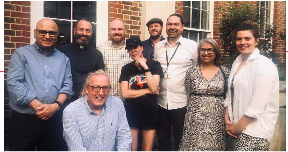
Action West London

This category celebrates projects that address the complex challenges of exclusion and discrimination faced by Londoners due to their faith or belief, as well as other aspects of their identity. These initiatives work at the intersection of faith, belief, and identity to create inclusive, welcoming spaces where everyone feels valued.