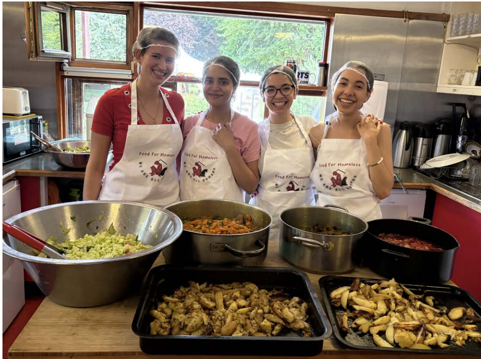
Food For Homeless Project