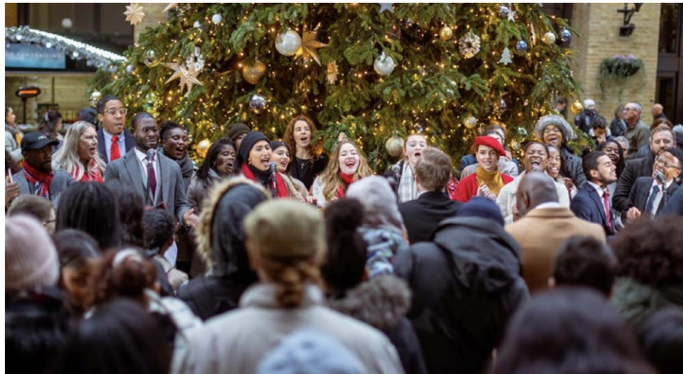
The London Collective Choir

The London Collective Choir — where every voice matters, and every song brings us closer together.