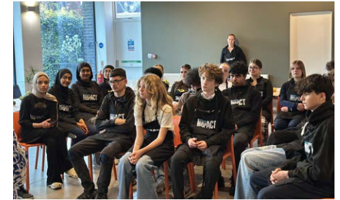
ImpACT Youth Kitchen

In April 2025, these three outstanding London Dangoor Award winners joined together at the ImpACT Youth Kitchen for a powerful interfaith social action project. After learning about food insecurity in the UK, they rolled up their sleeves to turn surplus produce from The Felix Project into over 150 nutritious meals, delivered that evening to local food banks and homeless shelters.