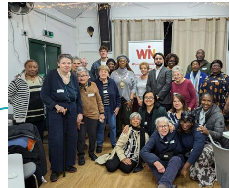
Food and Friendship