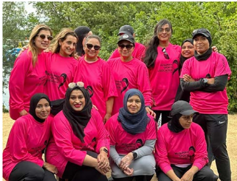
Muslimah Sports Association

Gaining charity status in 2019, they now offer over 15 different sports per week. They give an outlet to likeminded women and create a place where women are free to participate however they're comfortable to do so. They work with the best qualified female coaches from diverse backgrounds to ensure good quality sessions are on offer.