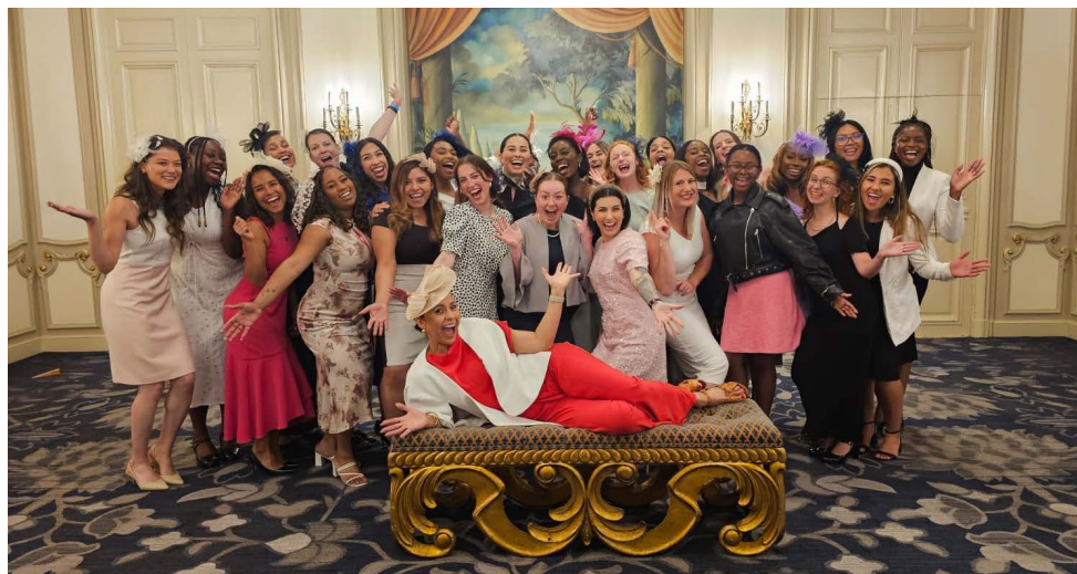
The International Christian Church's Women's Ministry