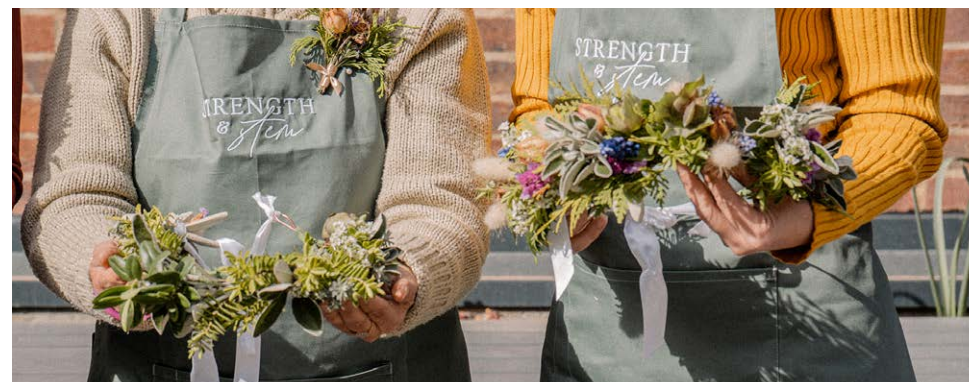
Strength & Stem