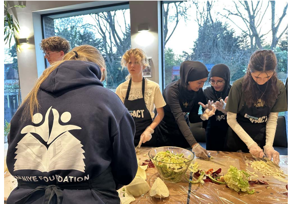
ImpACT Youth Kitchen