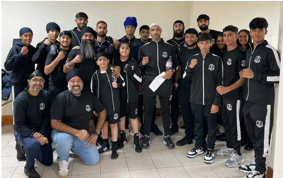
GC Boxing Academy