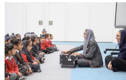
Nishkam School West London