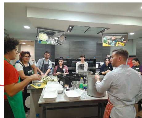
Jewish Volunteering Network