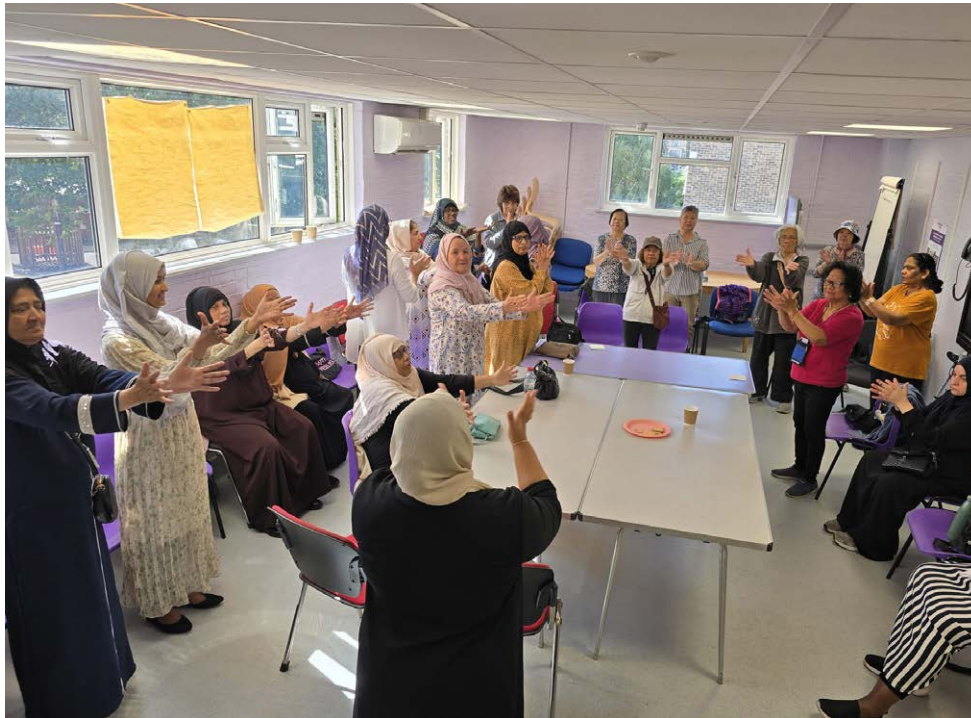
The Holistic Healthy Lifestyle Drop-in Service