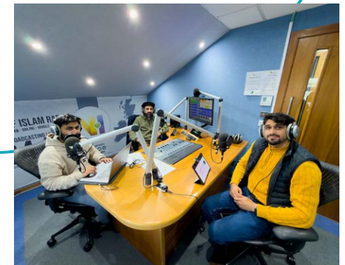
Voice of Islam Radio