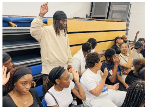
Parents & Youth Face to Face, The Truth That Sets Free Ministry

www.instagram.com/thetruththatsetsfreeministry/