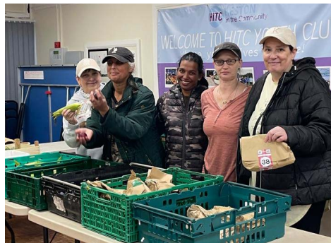
Heston farm Estate Gurseva Food bank