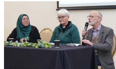
Faith in Environment

www.eastlondonmosque.org.uk/ news/climate-action-and-recycling- at-faith-in-environment-summit