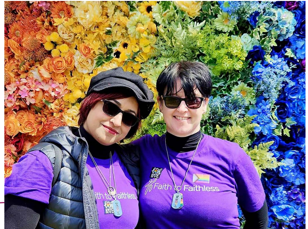
Faith to Faithless Women's Group

This category celebrates the extraordinary contributions of women from all walks of life to their communities and the city at large, often without the recognition they deserve. These initiatives empower women to effect change in their communities by providing education, advocacy, friendship, and a diverse range of support services.