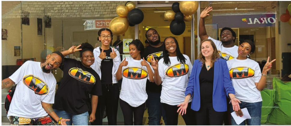
Sapphire Employability and Wellbeing Academy