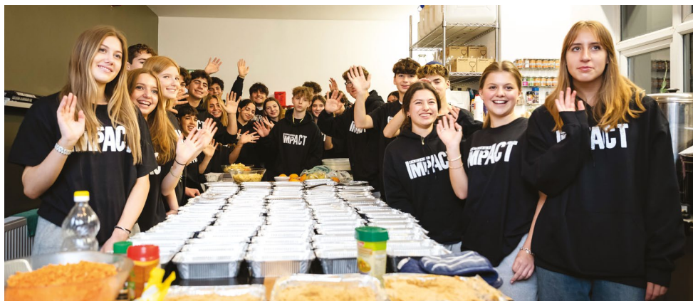
Project ImpACT Youth Community Kitchen