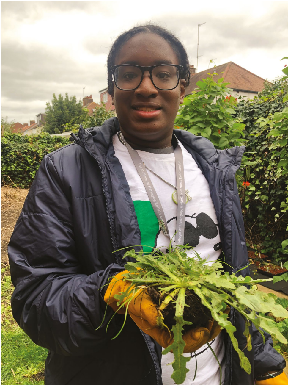
Windmill, St Aldhelm's Church Edmonton